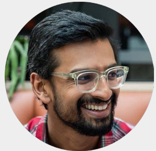
ILAHI Company Secretary